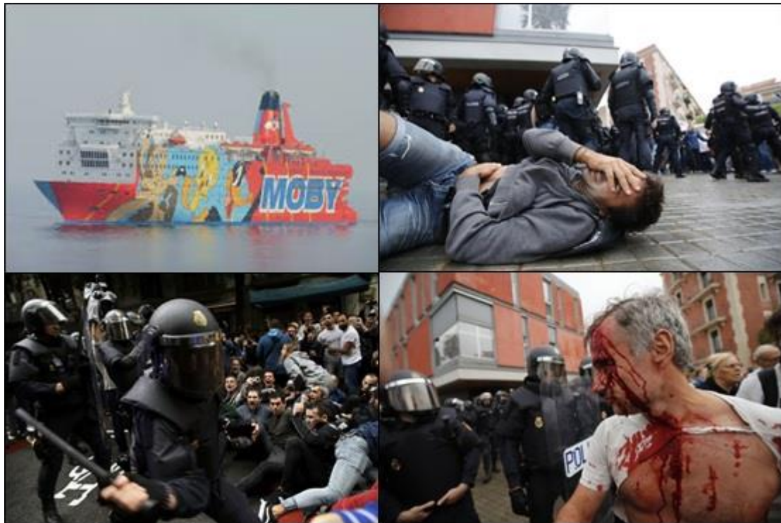
Figure 2. Police brutality on 1 October 2017. Image 1 (top left): the transatlantic where thousands of riot police were hosted in the Barcelona Harbor; image 2 (top right): “a man that falls down” (see gallery in endnote 15); image 3 (bottom left): riot police beating voters in polling places; image 4 (bottom right): a voter bleeding.

Wolfsfeld et al. (2008) coined the concept of an “ethnocentric mode of journalism”, according to which information may flow in a “victim mode”, that is, “highly prominent news stories, high levels of dramatization, the personalization of victims, ethnic solidarity stories, and demonization of the enemy” (Ginosar and Cohen, 2019: 8). This occurs when the so-called victims are on one’s own “side”. This contrasts with the defensive mode of reporting when victims are on the other “side, that is, “low prominence of news stories, an analytical perspective, depersonalization of the victims, and justification of the violence” (Ginosar and Cohen, 2019: 8). The contrast between the vocabulary and language used for each side will be further illustrated in the demonizing frame.